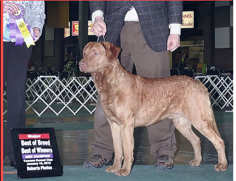
Max's New CH Win Picture

For more info, visit www.rosecityclassic.org and click on the RCC Student Art Contest link.