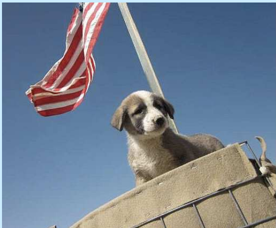
Smoke, the morale booster for troops in Afghanistan