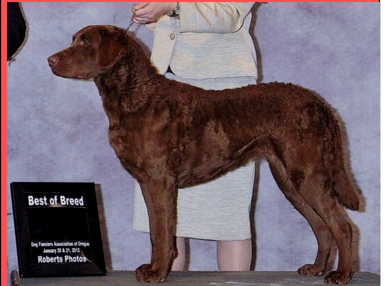
Kloe's BOB win at the Rose City Classic Cluster in Portland, OR