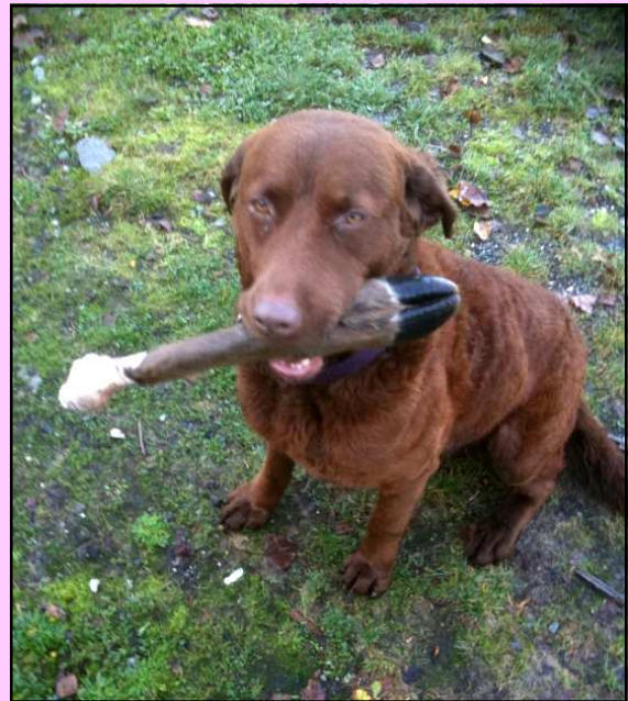
Chessies like Venison too!